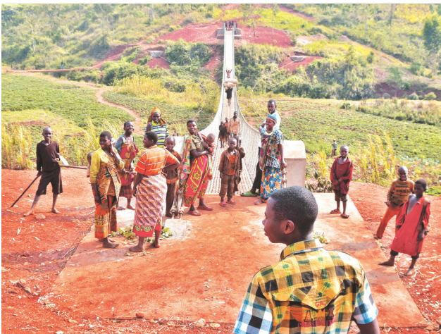
Nyakijima bridge