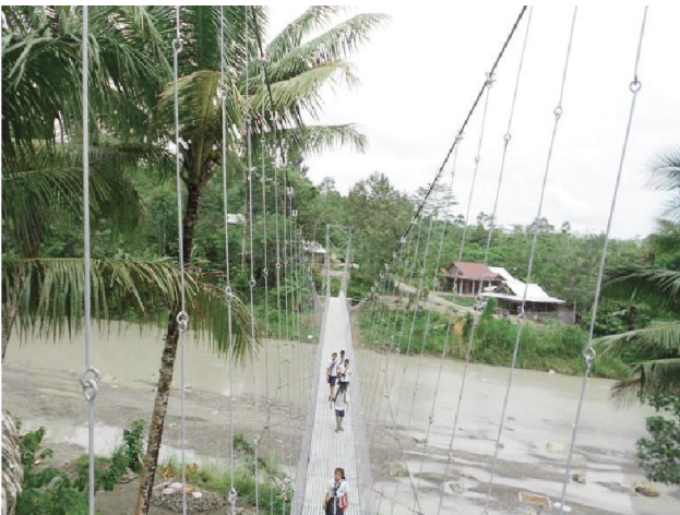
Moro'o bridge