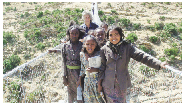
Kawa bridge