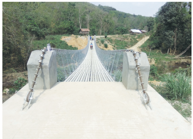
Skan “Tractorable” Bridge