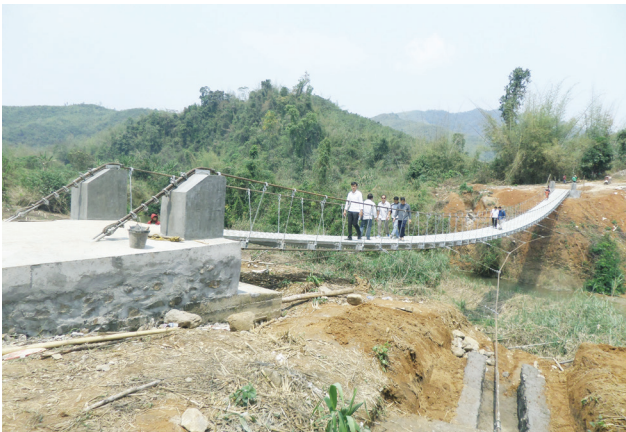
Chappe Pedestrian Bridge