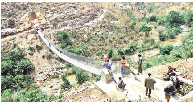
Miyobhoji bridge