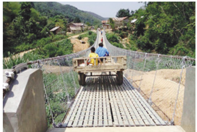
Skan “Tractorable” Bridge