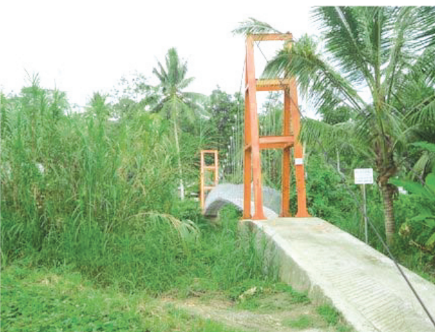
Iraonogambo bridge (maintained)