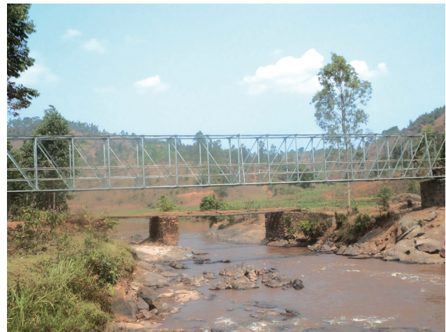
Ruvubu Steel Truss Bridge