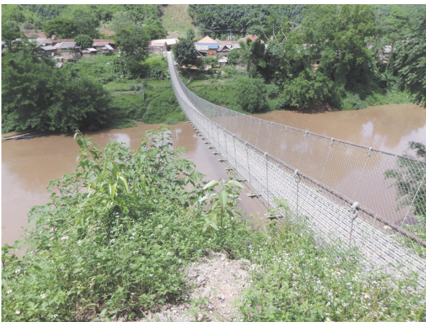
Mokjong Pedestrian Bridge