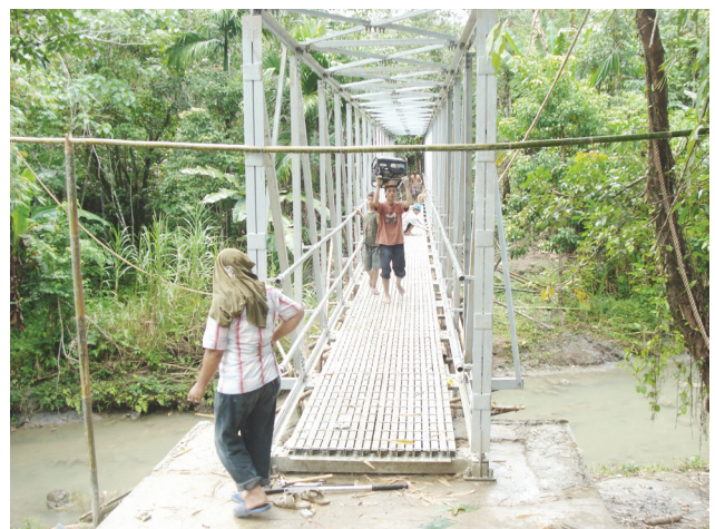
Alasa truss bridge