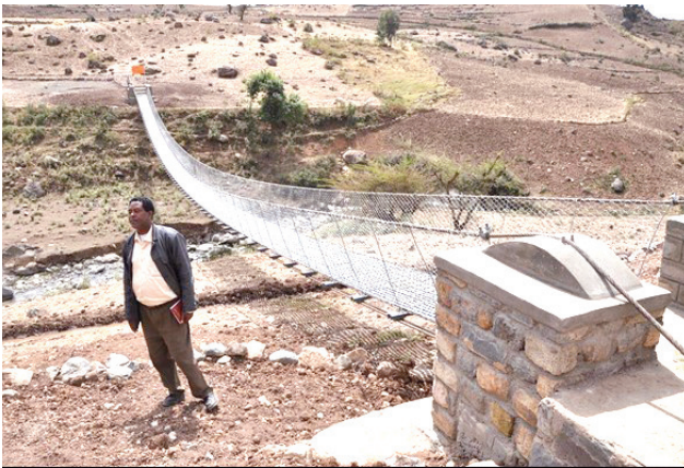
Entutie Suspension Bridge