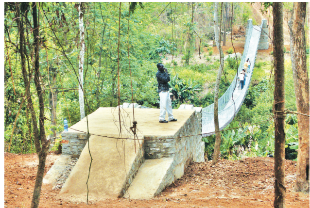
Srimajangar bridge