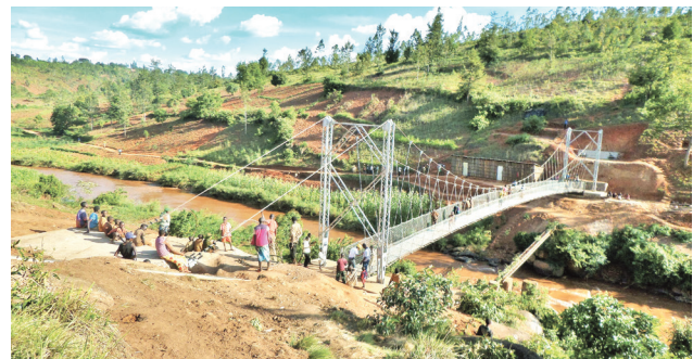
Kugatio bridge