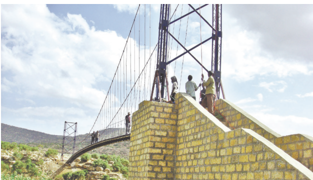
Endamino bridge