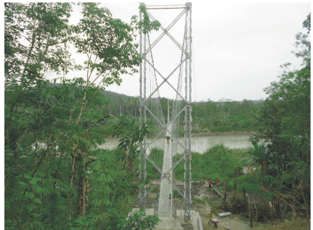
Oyo suspension bridge